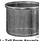
No. 612 - Tall Form Aquaria, hand made Used with metal cover as Animal Jar. 1/2 Gallon (#1) 6" diameter, 5" high. Gallon (#2) 7" diameter, 6" high. 1 1/2 Gallon (#3) 8 1/2" diameter, 8" high. 2 Gallon (#4) 9" diameter, 8" high. 3 Gallon (#5) 10" diameter, 9" high. 4 Gallon (#6) 11" diameter, 10 1/2" high. 5 Gallon (#7) 12" diameter, 11" high. 6 Gallon (#8) 13" diameter, 12" high. 8 Gallon (#9) 14" diameter, 13" high. 10 Gallon (#10) 15" diameter, 14" high. 12 Gallon (#11) 16" diameter, 15" high.