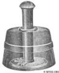
1 Pound Butter Mold, Wheat Print