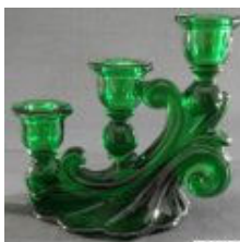
Caprice 1338 - 6" 3-lite Candlestick, Version 4 (Emerald) 3400 line accessory. Also Caprice Line accessory.