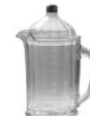
No. 845 - 32 oz. Photographers Measuring Jug with Glass Funnel Cover (Crystal) Pressed lines and figures. Jug with funnel cover and metal strainer. Available without cover.