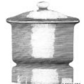
No. 683 - Fruehling & Schultz Desiccating Jar, Ground Cover with Knob Hand made, heavy weight. Inside diameter x inside height sizes: (#1)8"x8", (#2)10"x9 1/4".