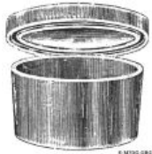
No. 677 - Stender Dish or Preparation Jar with Ground On Cover 1 3/8" diameter, 3/4" height. 1903 Number: No. 0 - Preparation Jar or 1903 Number: No. 1 - Preparation Jar or 1903 Number: No. 0 - Stender Dish.