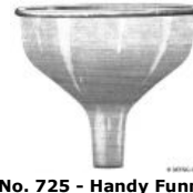
No. 725 - Handy Funnel Pressed, fire polished. (#1)2 1/4" (2 oz) & (#2)2 3/4" (4 oz) diameter (capacity) sizes.