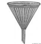
No. 695 - Ribbed Funnel, Fire Polished Ribbed, Pressed, Fire polished, making a stronger, more rugged funnel, less likely to chip. Same as No. 2260. (#1)2 1/2" (1 oz), (#2)2 3/4" (2 oz), (#3)3 3/4" (4 oz), (#4)4 3/4" (8 oz), (#5)5 3/4" (16 oz), (#6)7 1/4" (32 oz), (#7)8 3/4" (64 oz), (#8)10 1/4" (128 oz) & (#9)13" (256 oz) diameter (capacity) sizes.