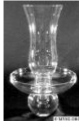
Cambridge Arms Unit #55, Hurricane Lamp (Crystal)

Also sold as Pristine 494/1538 /19/1606 - Hurricane Lamp with #19 Bobeche.