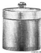
No. 764½ - Bandage or Surgical Dressing Jar & Cover, Unfinished Seam, Plain Round Knob Blown, with seam. (#1)9 oz. - 3" diameter, 3" height, (#2)20oz. - 4" diameter, 4" height, (#3)41 oz. - 5" diameter, 5" height, (#4)76 oz. - 6" diameter, 6" height, (#5)180 oz. - 8" diameter, 8" height. Also available - No cover.