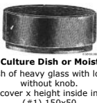
No. 669 - Culture Dish or Moist Chamber Large double dish of heavy glass with loose fitting cover without knob. Diameter of cover x height inside in millimeters: (#1) 150x50 (#2) 200x70 (#3) 220x70 (#4) 240x80