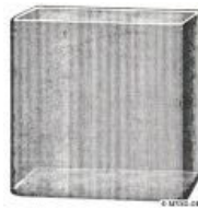
No. 925 - Oblong Aquaria or Museum Jar

(#1) 3" diameter, 2" height. (#2) 3¼" diameter, 2-1/16" height. (#3) 3½" diameter, 2½" height. (#4) 3¾" diameter, 2⅞" height. (#5) 4" diameter, 2¾" height. (#6) 4¾" diameter, 2½" height. (#7) 5" diameter, 2½" height. (#8) 5¼" diameter, 2½" height. (#9) 5½" diameter, 2½" height. Same as No. 626 Bell Glass.