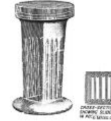
No. 673 - Coplin Staining Jar with Ground On Cover Standard size. With ground on cover. Capacity 10 slides 3" x 1".