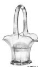
2800/221 - 9" Basket with 2899 2 1/4" Perforated Flower Block