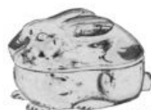
1316 - 7" (1 Pound) Rabbit Box and Cover aka Bunny Box.