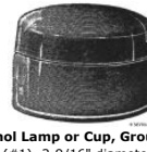
No. 609 - Alcohol Lamp or Cup, Ground on Flat Cover 3 oz. capacity (#1), 2-9/16" diameter, 1-9/16" depth. 8 oz. capacity (#2), 3 3/4" diameter, 2 1/4" depth.