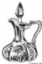
2760 - 7 oz. Oil Bottle and Stopper Version 1