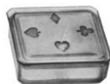
No. 605 - 3" x 3½" x 1½" Cigarette Box