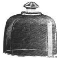
No. 920 - Watchmaker or Movement Cover

Also available: No. 913-A Plain, grooved to stack, No. 913-B Ground top edge, grooved to stack, not ground in, No. 913-C Ground top edge, ground in groove to stack and be air tight.