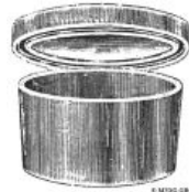
No. 678 - Stender Dish or Preparation Jar with Ground On Cover 2" diameter, 1" height. 1903 Number: No. 1 - Preparation Jar or 1903 Number: No. 2 - Preparation Jar or 1903 Number: No. 3 - Preparation Jar or Stender Dish.