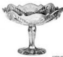
2766 - Footed Banquet Bowl, Version 1 Made in various sizes including 8".