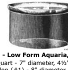
No. 611 - Low Form Aquaria, hand made Quart - 7" diameter, 4 1/2" high. Gallon (#1) - 8" diameter, 5" high. 1 1/2 Gallon - 9" diameter, 5 1/2" high. 2 Gallon (#2) - 10" diameter, 6 1/4" high. 2 1/4 Gallon - 11" diameter, 7" high. 3 Gallon (#3) - 12" diameter, 7 1/4" high. 3 3/4 Gallon - 13" diameter, 7 3/4" high. 4 1/2 Gallon (#4) - 14" diameter, 8 1/2" high. 5 1/2 Gallon (#5) - 15" diameter, 8 3/2" high. 7 Gallon (#6) - 16" diameter, 9 1/4" high. 8 1/2 Gallon (#7) - 17" diameter, 9 3/4" high. 10 Gallon (#8) - 18" diameter, 10 1/2" high.