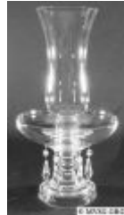
Cambridge Arms Unit #54 Hurricane Lamp (Crystal)

Includes Pristine #494 3½" candlestick, 1 #1538 6" Peg Nappy with Candlewell, 1 #27 Bobeche with #6 Prisms, 1 #1606 6" Chimney.