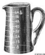
No. 740 - Graduated Acid Jug in Ounces (#1)16 oz, (#2)32 oz, (#3)64 oz & 128 oz sizes.