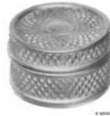
Mount Vernon 16 - 3" Toilet or Vanity Box Also sold as No. 613 - 2 oz. Benzine Cup.

Includes Pristine #510 Ball Candlestick, #1538 6" Peg Nappy with Candlewell, #1629 7" Chimney.