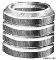
No. 913 - 2 5/8" Syracuse Watch Glass

1903 Number: No. 3 - "Syracuse" Watch Glass.