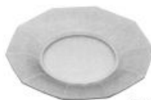
No. 597 - 8¾" Salad Plate Decagon Line.