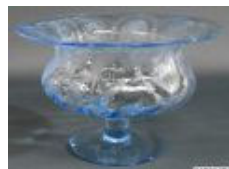
No. 405 - 9" Footed Bowl, E732 (Willow Blue)