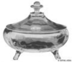
Pristine 300 - 6" 3-toed Candy Box and Cover

Old No. 300. Available Rose Knob. Available E Rose Point