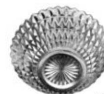
2860/269 - 6 1/4" Nappy, C Shape (Belled) Also made in 4 3/4" and 8 3/4" size.