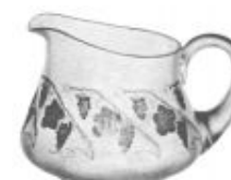
3000 - 4 1/2 Pint Jug, Optic, E521