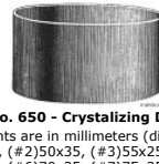
No. 650 - Crystallizing Dish All measurements are in millimeters (diameter x height): (#1)45x30, (#2)50x35, (#3)55x25, (#4)60x25, (#5)60x35, (#6)70x35, (#7)75x35, (#8)80x25, (#9)80x40, 85x30, (#10)90x30, (#11)95x40, (#12)100x40, (#13)100x50, (#14)115x45, (#15)120x45, (#16)125x65, (#17)140x45, (#18)150x45, (#19)150x65, (#20)150x75, (#21)185x65, (#22)185x75, (#23)190x95, (#24)200x65, (#25)200x75, (#26)210x70, (#27)220x70, (#28)230x85 and (#29)240x85.