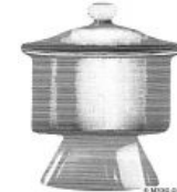
No. 682 - Scheibler Desiccating Jar, Ground Cover Hand made, heavy weight. Inside diameter x inside height sizes: (#1)4"x4 1/2", (#2)5"x6", (#3)6"x6", (#4)8"x8" & (#5)10"x9 1/4"