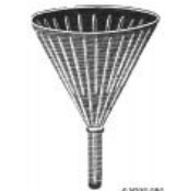
No. 696 - Ribbed Funnel, Unfinished Ribbed Pressed Same as No. 695 but not fire polished. (#1)2 1/2" (1 oz), (#2)2 3/4" (2 oz), (#3)3 3/4" (4 oz), (#4)4 3/4" (8 oz), (#5)5 3/4" (16 oz), (#6)7 1/4" (32 oz), (#7)8 3/4" (64 oz), (#8)10 1/4" (128 oz) and (#9)13" (256 oz) diameter (capacity) sizes.