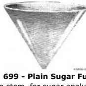
No. 699 - Plain Sugar Funnel No stem, for sugar analysis. (#1)2 3/4" (2 oz), (#2)3 3/4" (4 oz), (#3)4 3/4" (8 oz) & (#4)5 3/4" (16 oz) diameter (capacity) sizes.