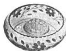
2943 - 3-footed Chinese Lily Bowl with 2899 Flower Block, Cut 2125 Made in 7 1/2", 9", 10" and 12" sizes.