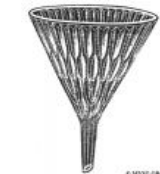
No. 727 - Funnel with Diagonal Fluting For rapid filtering, fire polished. 8 1/2" (64 oz) diameter (capacity) size.