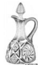
2699/297 - 8 oz. Oil Bottle, Stopper Version 1 Available with ground or drop stopper. Stopper shapes varied over the years.