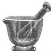
No. 826 - Mortar & Pestle Same as #3100. Available as a set or mortar only or pestle only. (#1)1 oz - 2¾" height, 2-11/16" diameter. (#2)2 oz - 2-11/16" height, 3-3/16" diameter. (#3)4 oz - 3-11/16" height, 4½" diameter. (#4)8 oz - 3¾" height, 4¾" diameter. (#5)16 oz - 4¾" height, 5¾" diameter. (#6)32 oz - 5¾" height, 6¼" diameter. 1903-1905-1907 Number: No. 3 - Mortar & Pestle