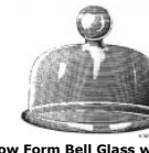
No. 625 - Low Form Bell Glass with Knob, Heavy Ground Flange Guaranteed to hold a vacuum when properly used. All measurements are inside. 3" diameter, 1 1/2" height. 4" diameter, 2 1/4" height. (#1) 5" diameter, 3 1/2" height. (#2) 6" diameter, 4" height. (#3) 7" diameter, 4 1/2" height. (#4) 8" diameter, 5" height. (#5) 9" diameter, 6" height. (#6) 10" diameter, 8" height. (#7) 12" diameter, 10" height. (#8) 16" diameter, 11" height. 1903 Number: No. 100 Bell Glass, Low Form.