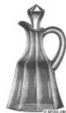
2630/296 - Oil Bottle, Stopper Version 1 Made in 5½ oz. and 7½ oz. sizes.