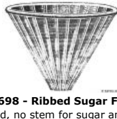
No. 698 - Ribbed Sugar Funnel Ribbed, no stem for sugar analysis. (#1)2 3/4" (2 oz), (#2)3 3/4" (4 oz), (#3)4 3/4" (8 oz) & (#4)5 3/4" (16 oz) diameter (capacity) sizes.