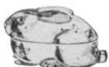
1315 - 5" (½ Pound) Rabbit Box and Cover aka Bunny Box.