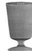
9072 - 8 oz. Low Foot Tumbler