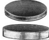
No. 670 - Culture or Petri Dish Cover, No. 671 - Bottom Dish Clear glass with flat bottom. Well annealed to withstand sterilization. Diameter of cover x inside height of lower dish in millimeters: (#1)50x10, (#2)60x10, (#3)60x15, (#4)75x10, (#5)75x15, (#6)80x10, (#7)80x15, (#8)90x10, (#9)100x10, 100x15, 100x20, (#10)110x15, 115x15, 120x15, 120x20, (#11)150x15, (#12)150x20, (#13)200x20, (#14)200x35, (#15)220x30, (#16)220x40 and (#17)240x50