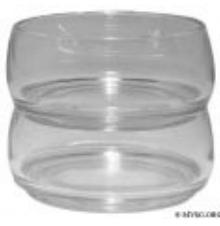
2590½ - Specimen Dishes (Crystal) Unknown Size. Available Sizes: 4½" and 8" diameter.