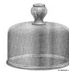
2033 - Cake or Cheese Cover Made in 7", 8", 9", 10", 11", 12", 13", 14", 15", 16", 17" and 18" sizes.

No Handle version believed to be Cambridge, but not confirmed.