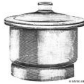
No. 685 - Fruehling & Schultz Desiccating Jar, Ground Knob Cover with Hole For stoppering. Hand made, heavy weight. Same as 683 except with hole in cover. Inside diameter x inside height sizes: (#1)8"x8", 8"x11", (#2)10"x9 1/4", and 10"x12".