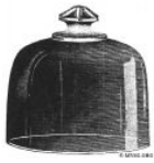
No. 626 - Bell Glass without Flange, Ground Level All measurements are inside. (#1) 3" diameter, 2" height. (#2) 3 1/4" diameter, 2-1/16" height. (#3) 3 1/2" diameter, 2 1/8" height. (#4) 3 3/4" diameter, 2 1/8" height. (#5) 4" diameter, 2 3/8" height. (#6) 4 3/4" diameter, 2 1/2" height. (#7) 5" diameter, 2 1/2" height. (#8) 5 1/4" diameter, 2 1/2" height. (#9) 5 1/2" diameter, 2 1/2" height. Same as No. 920 - Watchmaker or Movement Cover.