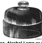
No. 608 - 12 oz. Alcohol Lamp or Cup, Ground on Knob Cover 3 3/4" diameter, 2 3/8" tall.