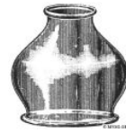
No. 631 - Bell Glass, Open Top, Ground Flange Top and Bottom All measurements are inside. Pint - 3" diameter, 5" height. Quart - 4" diameter, 6 1/2" height. (#1) 1/2 Gallon - 5" diameter, 8" height. (#2) Gallon - 6" diameter, 10" height. (#3) 2 Gallon - 7" diameter, 12" height. (#4) 3 Gallon - 8 1/2" diameter, 15" height. (#5) 5 gallon - 10" diameter, 16" height.