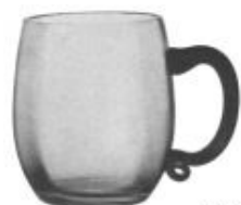
3400/107 - 14 oz. Mug or Stein Crystal Handle.