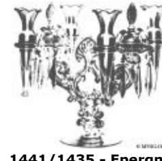
1441/1435 - Epergne Includes: #1441 2-lite Candlestick, 2 - #1435 2-vase Arms, 4 - 2355 8" Vases, 2 - #19 upside down Bobeche & 16 - #1 Prisms.