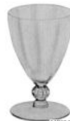
1066 - 3 oz. Footed & Stemmed Tumbler, Optic