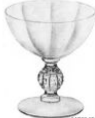
1066 - 7 oz. Tall Sherbet, Optic