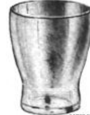
1066 - 5 oz. Light Blown Tumbler, Optic