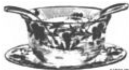
1402/133 - 4-piece Twin Salad Dressing Set, R. C. Eng. 901