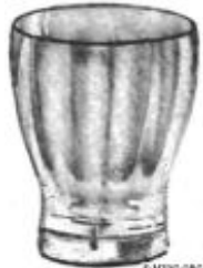
1066 - 5 oz. Light Blown Tumbler, Shammed, Optic