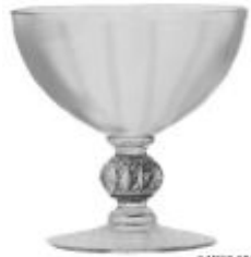
1066 - 7 oz. Low Sherbet, Optic