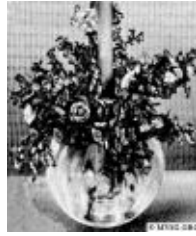
1410 - 6" Floating Rose Bowl with No. 1050 Candle Holder