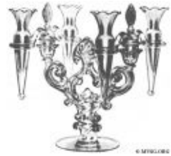
1441/1435 - Epergne without bobeches Includes: #1441 2-lite Candlestick, 2 - #1435 2-vase Arms, 4 - 2355 8" Vases.