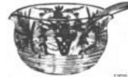
1402/17 - 2-piece Mayonnaise Set, R. C. Eng. 900 (Grey Flower)