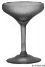
7801 - 2½ oz. Crème de Menthe Original No. 7967 - 2½ oz. Crème de Menthe 4¼" tall.