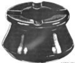
No. 641 - 4" 2-piece Ash Well