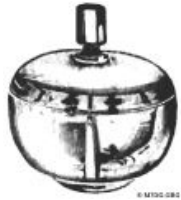
Pristine 307 - 6" 3-compartment Candy Box and Cover