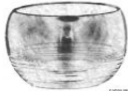
1402/14 - Finger Bowl