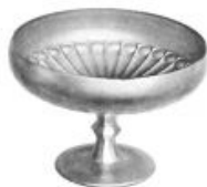
Wetherford 4071/76 - 7¾" Footed Fruit Bowl, Round Shape

The Chelsea 4070/71 - 5¾" 3-footed Bowl, Straight image is shown. The 4070/71 mold was reworked in 1925 to create the mold for the Wetherford 4071/71 - 5¾" 3-footed Bowl, Straight mold.