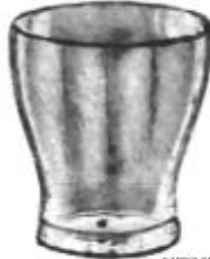
1066 - 2½ oz. Light Blown Tumbler, Optic