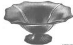
3400/3 - 11" Low Footed Bowl or Comport