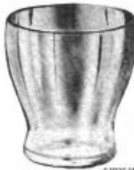
1066 - 7 oz. Light Blown Tumbler, Optic aka Old Fashioned Cocktail.