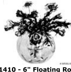
1410 - 6" Floating Rose Bowl with No. 1503 - 2 1/2" Flower Holder