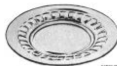
Martha Washington 21 - 8⅜" Salad Plate, Plain Bottom