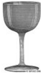
7801 - 4 oz. Claret Original No. 7901 - 4 oz. Claret.