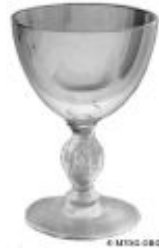
1066 - 3½ oz. Cocktail