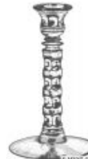
Martha Washington 3 - 9" Candlestick, Version 2