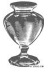
1303 - 7" Vase