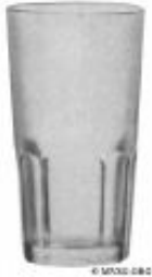
1203 - 13 oz. Tumbler