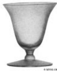
7801 - 4½ oz. Oyster Cocktail Original No. 7608 - 4½ oz. Oyster Cocktail