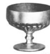
Wetherford 4071/22 - 5 oz. Low Footed Sherbet, Cupped

The Chelsea 4070/17 - 9 oz. Straight Table Tumbler image is shown. The 4070/17 mold was reworked in 1925 to create the mold for the Wetherford 4071/17 - 9 oz. Straight Table Tumbler mold.