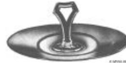
No. 168 - 10" Sandwich Tray