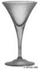
7801 - 3½ oz. Cocktail Original No. 7966 - 3½ oz. Cocktail Pristine Line accessory.