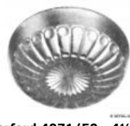
Wetherford 4071/50 - 4½" Fruit Saucer mold

The Chelsea 4070/48 - 7" Deep Bowl, Straight image is shown. The 4070/48 mold was reworked in 1925 to create the mold for the Wetherford 4071/48 - 7" Deep Bowl, Straight mold.