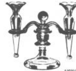
No. 639/1433 - Epergne With #1433 - 6" 2-vase Arm, 2 - 6" #2355 vases.