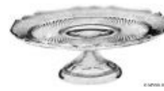
Mount Vernon 48 - 13½" Cake Salver