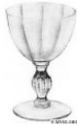
1066 - 3½ oz. Tall Cocktail, Optic