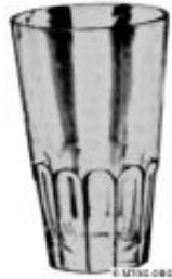
1203 - 14 oz. Tumbler, Shammed