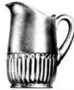
Wetherford 4071/2 - 3 Pint Barrel Shape Jug

The Chelsea 4070/2 - 3 Pint Barrel Shape Jug image is shown. The 4070/2 mold was reworked in 1925 to create the mold for the Wetherford 4071/2 - 3 Pint Barrel mold.