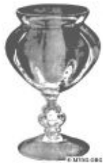
1302 - 9" Vase