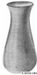
No. 80 - 10" vase Old No. 2357 - 10" Vase.