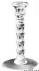
Martha Washington 3 - 9" Candlestick, Version 1