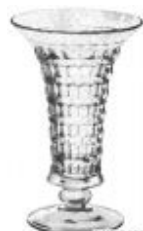
Martha Washington 18 - 11" Footed Vase, Flared, Version 2