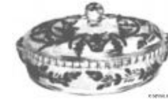
3500/78 - 6" Candy Box and Cover, Eng. 901 (Grey Cut)