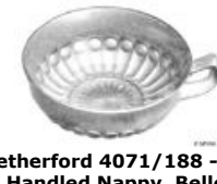
Wetherford 4071/188 - 5½" Handled Nappy, Belled

The Chelsea 4070/100 - Handled Lemonade, Cupped image is shown. The 4070/100 mold was reworked in 1925 to create the mold for the Wetherford 4071/100 - Handled Lemonade, Cupped mold.