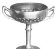
Wetherford 4071/79 - 5½" Tall Footed and Handled Comport

The Chelsea 4070/76 - 7¾" Footed Fruit Bowl, Round Shape image is shown. The 4070/76 mold was reworked in 1925 to create the mold for the Wetherford 4071/76 - 7¾" Footed Fruit Bowl, Round Shape mold.