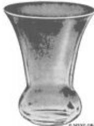
No. 782 - 8" Vase