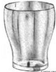
1066 - 10 oz. Light Blown Tumbler, Optic