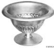
Wetherford 4071/99 - Footed Lemonade Bowl, Rolled Edge

The Chelsea 4070/79 - 5½" Tall Footed and Handled Comport image is shown. The 4070/79 mold was reworked in 1925 to create the mold for the Wetherford 4071/79 - 5½" Tall Footed and Handled Comport mold.