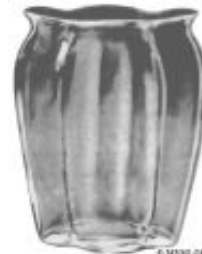
1228 - 9" Oval Vase