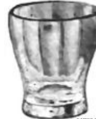
1066 - 2½ oz. Light Blown Tumbler, Shammed, Optic