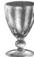
1066 - 9 oz. Footed & Stemmed Tumbler, Optic