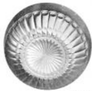
Wetherford 4071/47 - 8½" Deep Bowl, Straight

The Chelsea 4070/22 - 5 oz. Low Footed Sherbet, Cupped image is shown. The 4070/22 mold was reworked in 1925 to create the mold for the Wetherford 4071/22 - 5 oz. Low Footed Sherbet, Cupped mold.