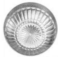
Wetherford 4071/48 - 7" Deep Bowl, Straight

The Chelsea 4070/47 - 8½" Deep Bowl, Straight image is shown. The 4070/47 mold was reworked in 1925 to create the mold for the Wetherford 4071/47 - 8½" Deep Bowl, Straight mold.