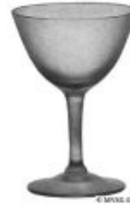
7801 - 4 oz. Sidecar Cocktail Original No. 7911 - 4 oz. Sidecar Cocktail.