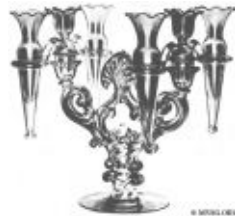
1441/1438 - Epergne without Bobeches Includes: #1441 2-lite Candlestick, 2 - #1438 2-vase Arms, 4 - 2355 8" Vases.