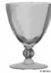
1066 - 5 oz. Oyster Cocktail