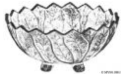
Arcadia 57 - 10" Deep Salad Bowl