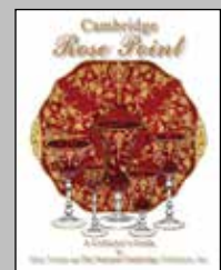
Cambridge Rose Point