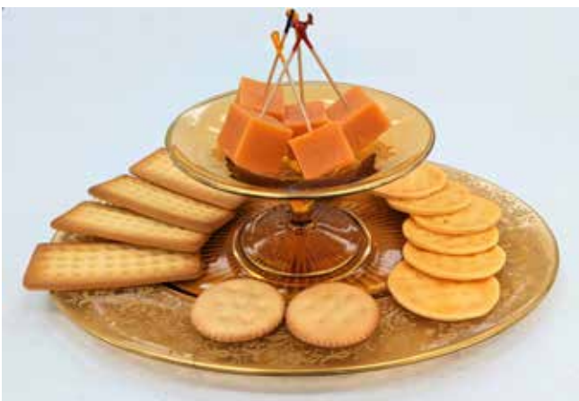
NCC Crystal Ball