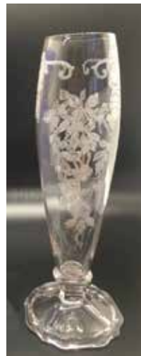
1284 10 in Ftd Vase Apple Blossom