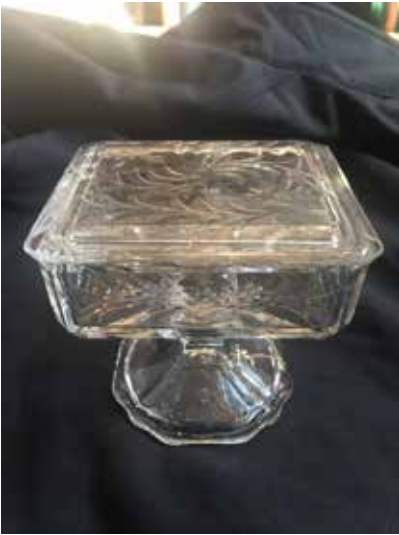
1312 Ftd Cigarette Box and Cover