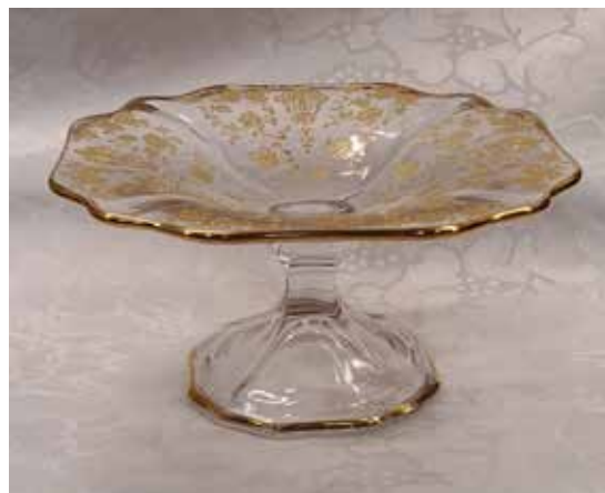
3400/7 Comport for Cheese and Cracker