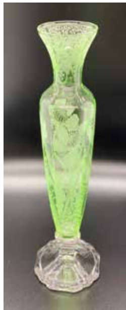
1300 8 in Ftd Vase Light Emerald Gloria