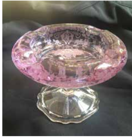
1311 4 in Ftd Ash Tray