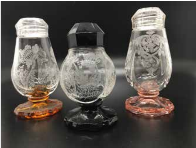
3400/76 Shaker with black cover Glass Top and two 3400/77 Shakers