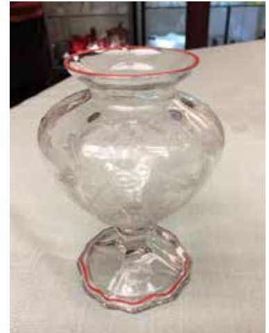
1303 7 in Ftd Vase Enamel Edge Lorna