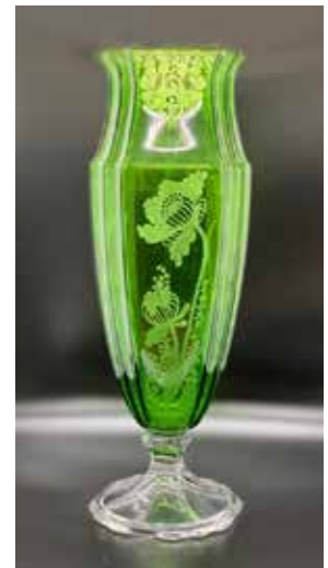
1298 13 in Ftd Vase Gloria