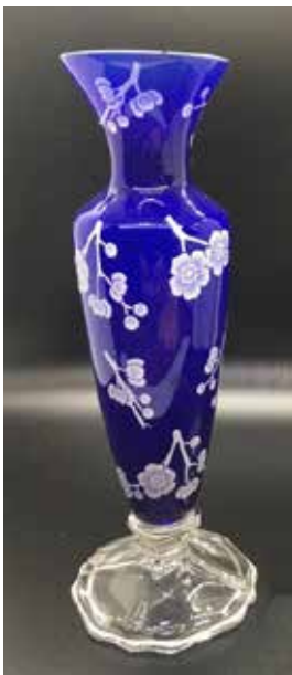
1300 8 in Ftd Vase Royal Blue Japanica