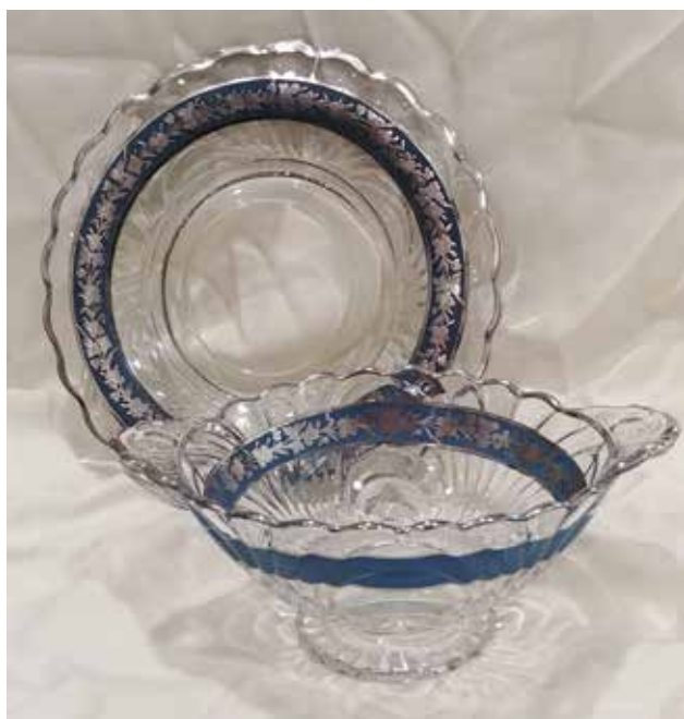
Caprice #106 Mayo Set with silver on blue decoration