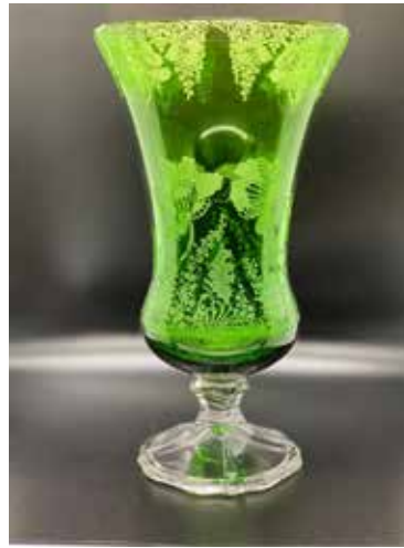
1299 11 in Ftd Vase Gloria