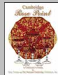
Cambridge Rose Point