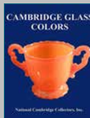
Cambridge Glass Colors

The following books can be purchased on Amazon and downloaded to your Kindle device