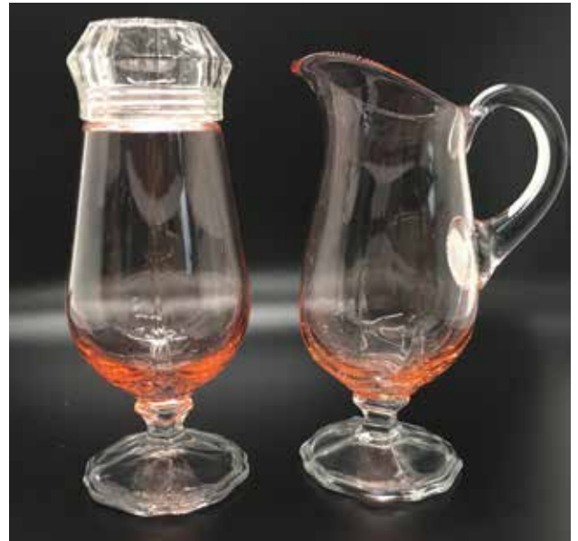
3400/40 Sugar Shaker and 3400/39 Tall Cream