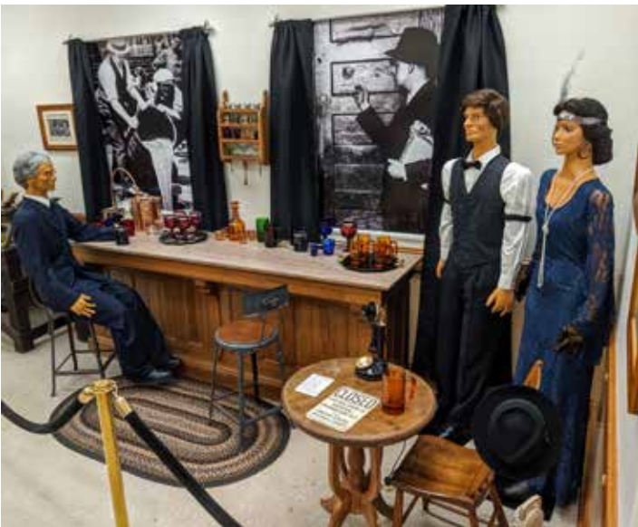
The new Roaring 20s exhibit is ready for visitors. Be sure to visit when you come to the museum. You might even get a sip of Happy Jack, AKA apple juice!