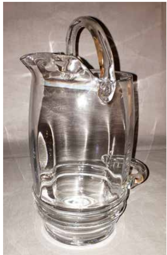
1560 - 80 oz. Ice Lipped Jug, 2 Handles