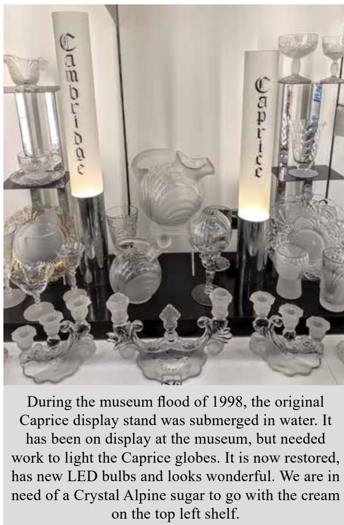
During the museum flood of 1998, the original Caprice display stand was submerged in water. It has been on display at the museum, but needed work to light the Caprice globes. It is now restored, has new LED bulbs and looks wonderful. We are in need of a Crystal Alpine sugar to go with the cream on the top left shelf.