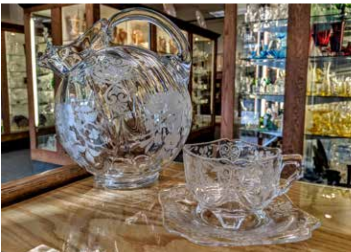
A recent donation to the museum: 3400/38 80 oz. ball jug, etched Apple Blossom and a 3400/50 square 4-toed cup and saucer, etched Apple Blossom.,