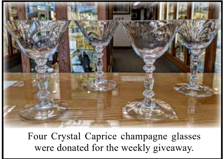
Four Crystal Caprice champagne glasses were donated for the weekly giveaway.

This summer the VCB has been doing a giveaway each week on their Facebook page. Area attractions, non-profits and hotels have provided the items. In September, the museum donated 4 Cambridge Caprice champagne glasses for the giveaway. It was amazing to watch the post reach, and read the comments by people wanting to win the Cambridge Glass. At the conclusion, we were provided with the statistics from the Facebook giveaway post: 269 Comments, 311 Shares and 12,620 People Reached. Excellent publicity for Cambridge Glass! This is the text from the post and a few comments.