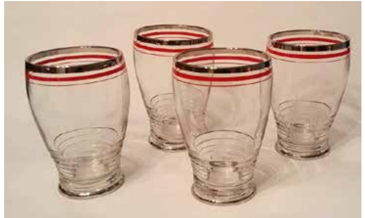
1402/44 15 oz tumbler with platinum & orange band