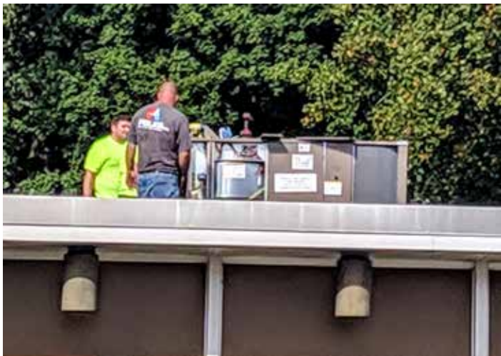
A close up of the Ables team on the roof as the crane moved away from the museum building.

Each year the Cambridge Area Chamber of Commerce schedules a museum tour for both their Adult Leadership and Student Leadership groups. This is a wonderful way for business leaders in the community to experience the museum, and also provides an opportunity for us to make a connection with them. They are always amazed to see the beautiful glassware and very interested in the industrial history and stories about the employees of The Cambridge Glass Company.