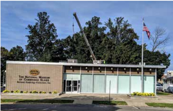
The crane, lifting the new Gas HVAC unit up to the roof, was located behind the museum. Work was done on a Tuesday when the museum was closed.

Good news! A new gas/electric HVAC unit has been installed on the roof of the museum. The unit was a gift from members Jim and Nancy Finley and serves the auditorium area of the museum. We now have 2 of the 4 roof units converted to gas. This saves money during the winter months. Many thanks to Jim and Nancy from NCC!