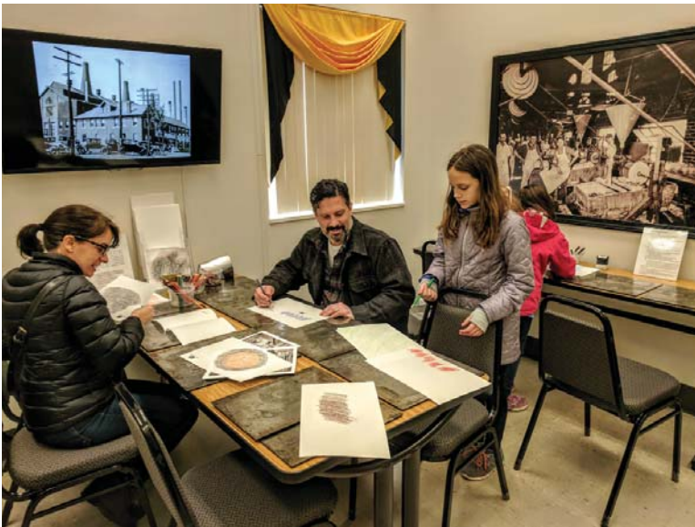
This family visited the museum on opening day and had a good time learning about the etching process.