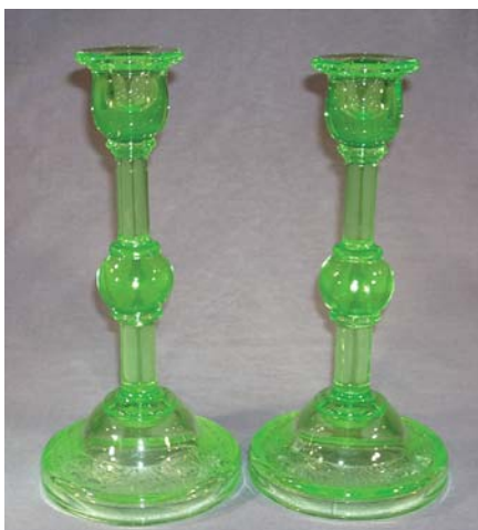
No. 225 Light Emerald candlesticks with E714