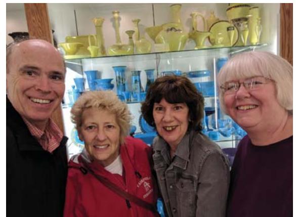
As we were working at the museum the day before we officially opened, this couple came to the door and we let them in for a short visit. They loved the museum and wanted to do a “selfie”. This was our first “selfie” with visitors!