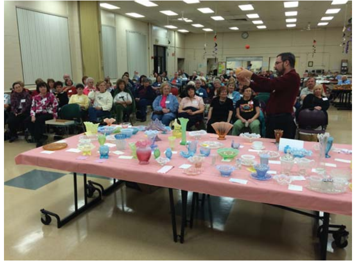
Members having fun at a recent meeting.

MDGS has been holding their monthly meetings for 45 years. The club has 250 members, and each meeting draws between 80 to 100 attendees. They also hold an annual show in Dearborn, Michigan the first weekend of each November, which attracts over 1,200 attendees.