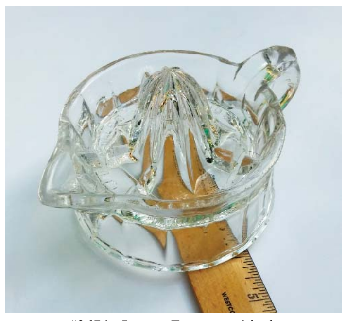
#2674 - Lemon Extractor, 4 inch