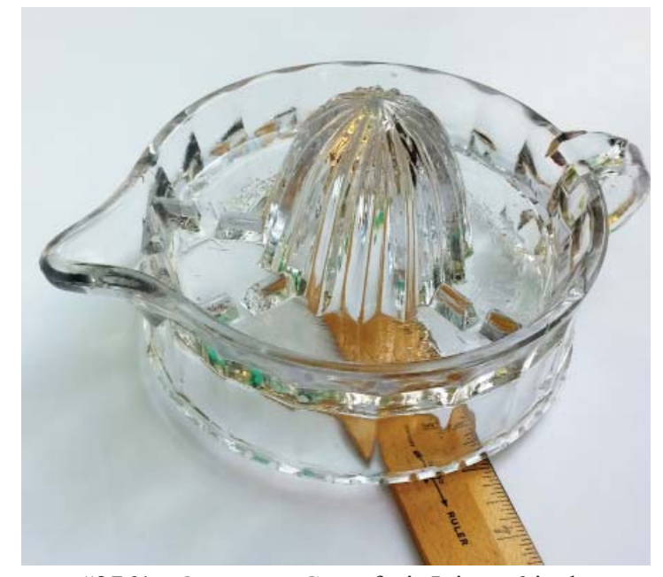
#2761 - Orange or Grapefruit Juicer, 6 inch