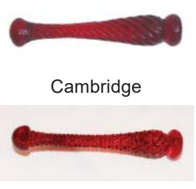
Duncan & Miller

eBay sellers repeatedly offer glass muddlers and attribute them to the wrong maker. A pair of ruby Duncan & Miller muddlers were offered as Cambridge, and sold for $32. The seller was so excited at this