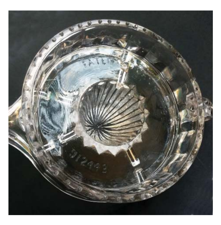
Bottom View PATENTED JAN 6TH 1909 NO. 912443