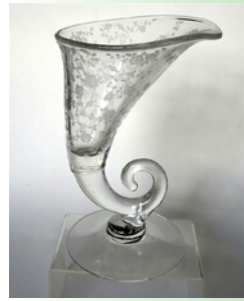
3900/575 10” Cornucopia vase