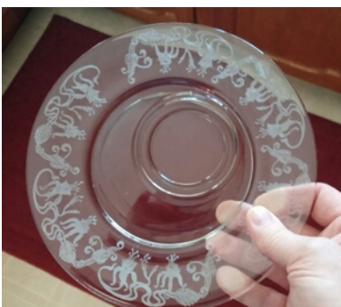
8 ¼" canapé plate. Also known in an oval version 8 ½" x 6 ¾"