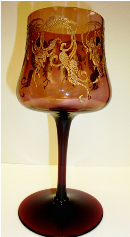
Mulberry 7606 mulberry goblet with gold encrusted etch