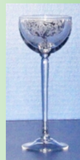
3104 cocktail etch Diane