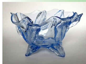
Willow Blue Everglade leaf line 11” bowl