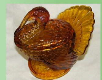
Amber 1222 Turkey