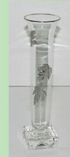
3797/80 8” bud vase