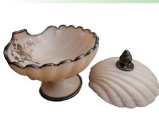
Crown Tuscan Seashell candy box with Rockwell Sea Horse decoration