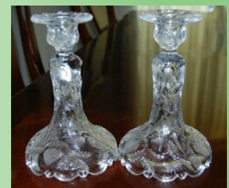
Near Cut Strawberry candlestickss