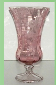
1299 Pink vase etch Apple Blossom