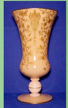
1620 GE Rose Point vase