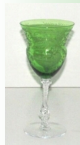
3126 Forest Green goblet etch Portia