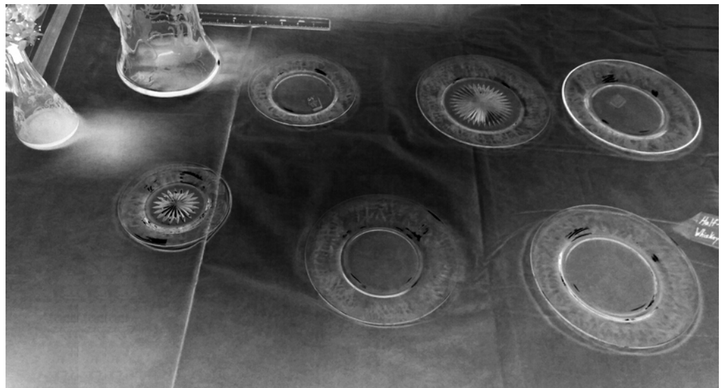
Assorted plates shown during the program at the June 2014 convention. Note that some plates have a clear center and others have a star pattern.