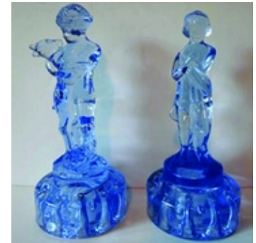
Moonlight Blue; No. 518 - 8½" Draped Lady Flower Holder and a rare No. 509 - 2-kid Flower Holder