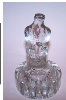
Crystal No. 514 - Eagle flower figure