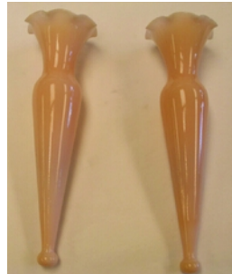
Crown Tuscan 2355 - 8" Cambridge arm vases