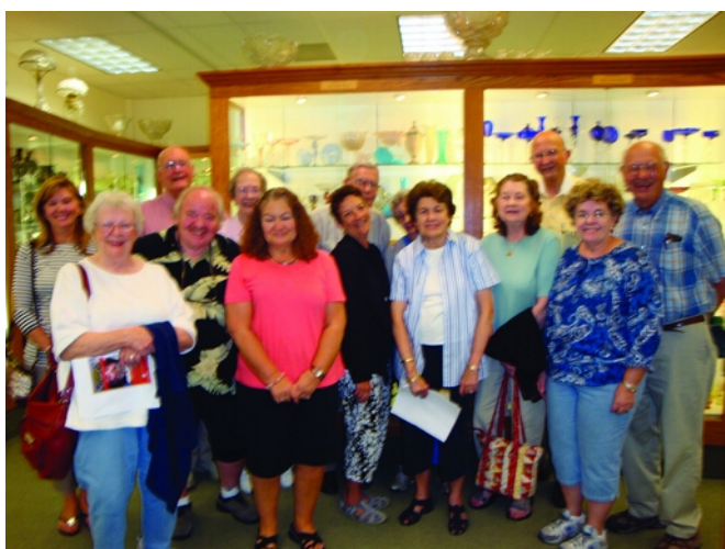
On September 7 th a group from Montgomery Church in Cincinnati, Ohio arrived to tour the museum. They were so interested and involved that they stayed for two hours. What a wonderful group of people!