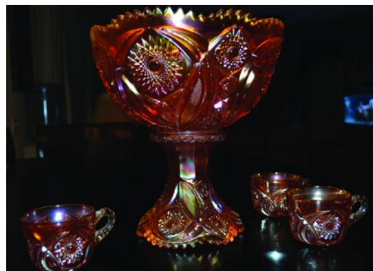
2351 - 10" Punch Bowl and Foot (Marigold Carnival Bowl, with the Carnival Base and three cups)