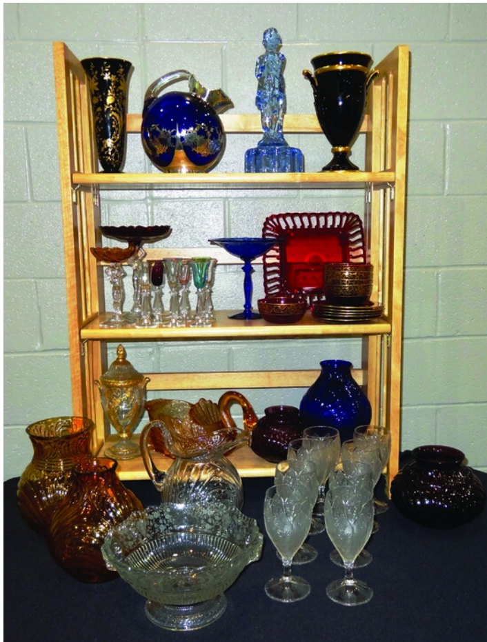
Glass included in the 2013 Museum Forever Raffle.

Please fill out the reservation form on page 5 to join us on November 2 for an enjoyable weekend. The conversations promise to be extraordinary. “Downton Abbey” dinner jackets are entirely optional. See you next month!