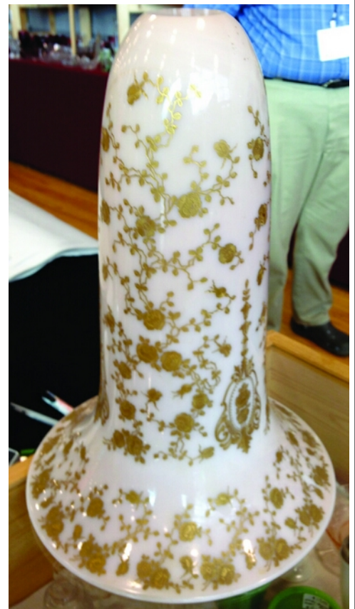
Rose Point piece seen at the 2012 show.