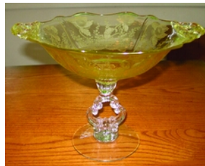
3400/30 - 9½" 2-handle footed bowl (Mandarin Gold bowl, Crystal foot/stem), E 746 Gloria