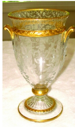
3500/44 - 8" footed vase GE Elaine