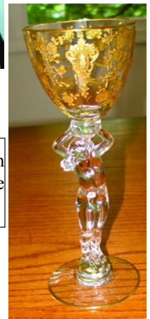
3011/7 claret with ultra-rare GE Rose Point