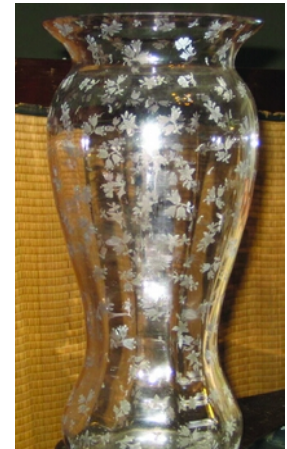
1335 - 12" vase, E758 Chintz (#1)