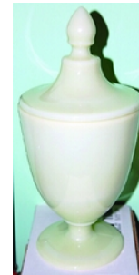
Ivory #96 - ½ pound covered candy