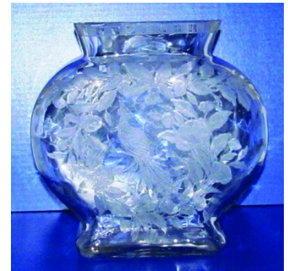
1002 - 1 1/2 Gallon Aquarium, E736