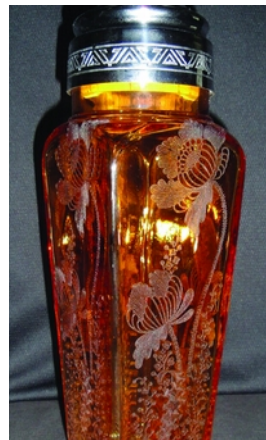
E Gloria 3400/158 - Cocktail Shaker