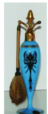
Azurite perfume atomizer w/ Black Enamel #739 etching