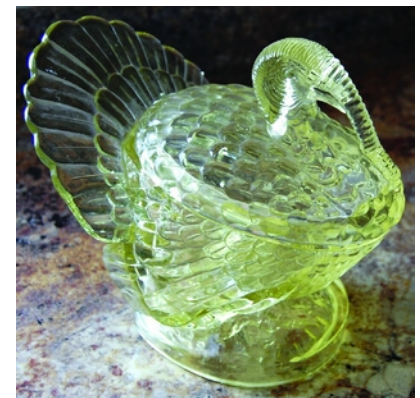
Gold Krystol turkey