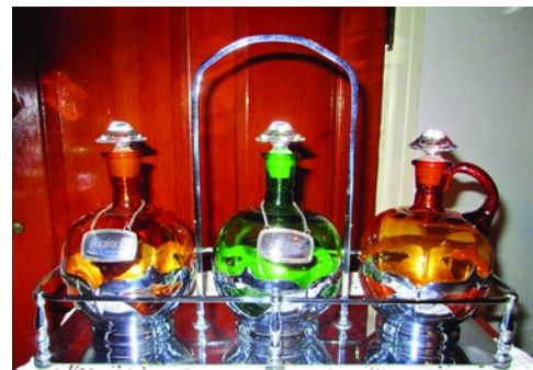
Farber liquor set with three 3400/113 - 38 oz. decanters