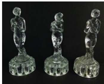
#508 - Crystal 9" Mandolin Lady Figure Flower Holders