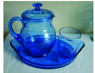
#488 - Ritz Blue 4 piece Night Set