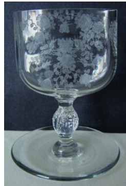
1066 - oval cigarette holder with ash tray foot Rose Point