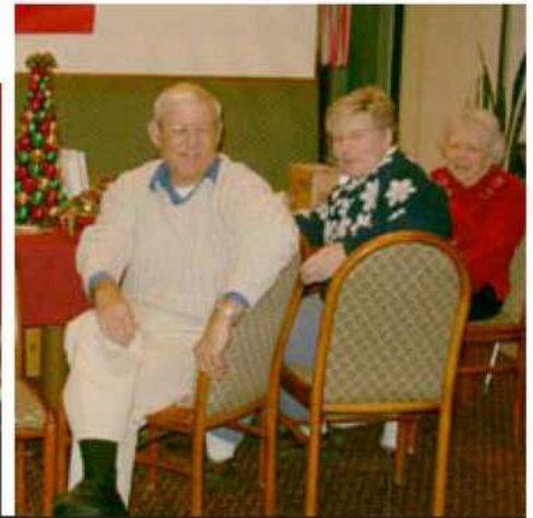
The Columbus Wildflowers Study Group met for their annual Holiday meeting and Gift Exchange. Read about it on page 17.