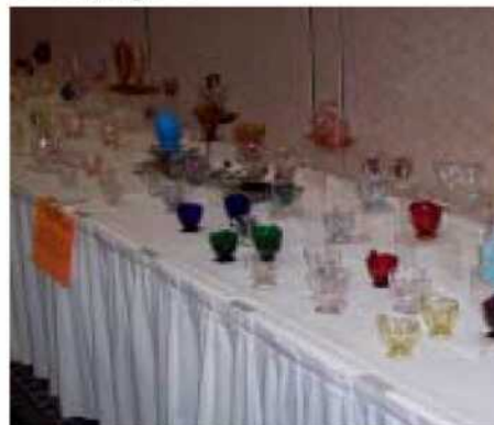
Gwenell Pierce provided an impressive collection of cream & sugar sets from numerous companies.

which prompted a visitor to the show to purchase a set of red Scotty dogs at the NCC table. Thanks to the show promoters Shirley and Art Moore for providing NCC with a table.