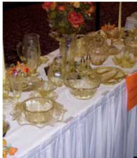
Will and Mary Lou Shuck's display of Cambridge Yellow Apple Blossom at the "Age of Elegance" show