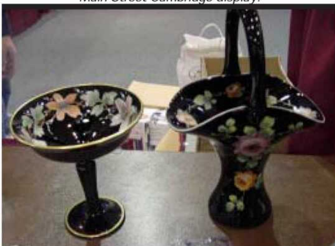
Just two of the pieces displayed at "Bring & Brag" following the March Quarterly Meeting. The comport on the left was decorated by Lotus, while the basket on the right was decorated in house by Cambridge. What beauties!!!