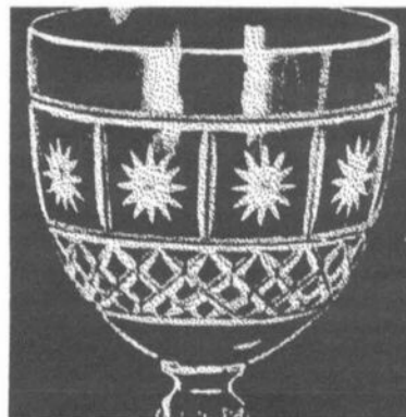
953 AMERICAN STAR