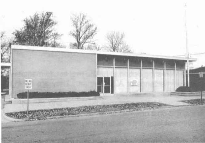
Exterior of the Power Building

another small room that could be used as the Museum workers' office and storeroom.