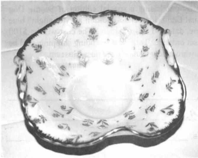
Crown Tuscan Gold-Encrusted Chintz Candy Dish