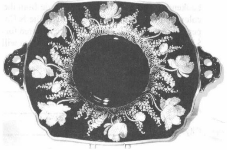
3400/1186 Royal Blue 12 1/2" Two-Handled Plate with Silver Gloria