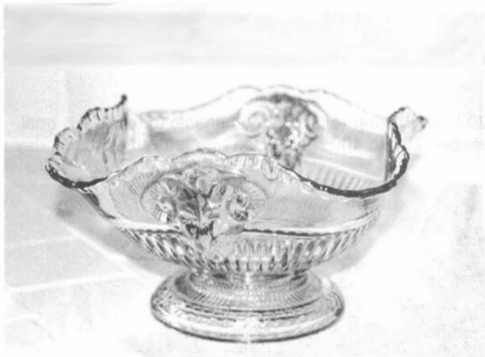
Dianthus Pink Gadron Ram's Head Fruit Basket