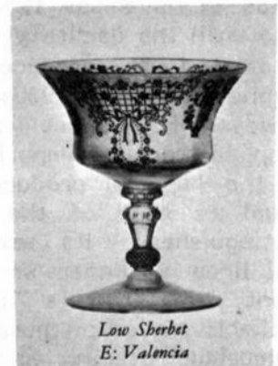
Low Sherbet E: Valencia

MINERVA & VALENCIA: Minerva #763, and Valencia #761, were added to the Cambridge line in 1933 and remained available thru 1939. Despite the fact relatively few pieces of these etchings are seen today, both were placed on complete stemware and dinnerware lines, #3400, Gadroon and Tally-Ho. Production of these etchings on colored blanks was limited and such pieces are seen even less frequently than crystal pieces. Minerva and Valencia were gold encrusted as well as being available plain and plain with a gold edge.