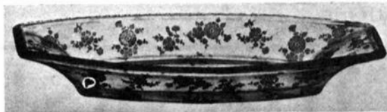
652. 12 in. Celery

VICHY: Shown in the 1934 Cambridge catalog supplement on #3129 stemware. Vichy was discontinued prior to 1940 only to be revived during the early 1950s for use on a barware line. Not often seen today, Vichy or etching #765 was probably used only on crystal blanks. One distinction about Vichy is that it was one of the few etchings to be used on the #3011 or Nude stemware line.