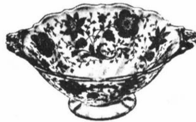
3900/130 7 in. 2 handled Ftd. Bonbon

known. Not available in the transparent colors, Candlelight will be found plain, gold encrusted or with a gold edge on crystal blanks and to a limited extent, gold encrusted on Crown Tuscan.