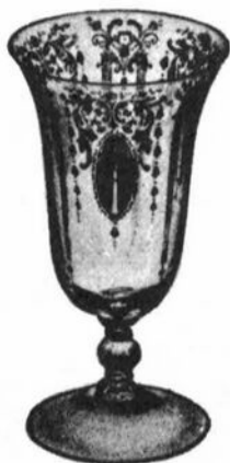
3111 5 oz. Ftd. Tumbler

ROSEPOINT: Rosepoint, the premier Cambridge etching, was introduced to the trade in November 1934 and continued to be sold until the demise of the Company. Imperial attempted to produce Rosepoint and for awhile during the 1960s did offer a short line; however, it was not successful and was soon dropped from the Imperial catalog. The quality of the Imperial produced Rosepoint was not equal to that of the original and can be distinguished by its lack of depth. Produced in full lines of dinnerware and stemware, Rosepoint, due to its great popularity, was probably placed on more blanks than any other Cambridge etching and most any item produced by Cambridge after 1935 may have been etched Rosepoint. Rosepoint, while primarily placed on crystal blanks and then sold plain, or further decorated with gold, was done to a limited extent on colored blanks. Pieces are known in carmen, amber and ebony gold encrusted.