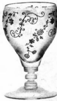
1402/150 3 oz. Wine

ELAINE: The Elaine or #762 etching was, at one time, available on more blanks than Rosepoint, but its popularity was eventually