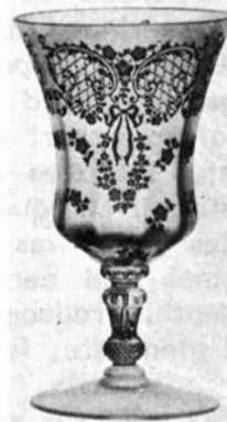
10 oz. Tumbler E: Minerva

surpassed by the latter etching. Brought out in 1933 and in the Cambridge catalog until 1954, there are at least six lines of Elaine etched stemware and three of dinnerware. Primarily placed onto crystal blanks, Elaine will be found with a gold edge and gold encrusted in addition to plain etched crystal blanks. On rare occasions, an Elaine etched colored blank will be found.