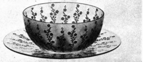
Finger Bowl and Plate

MINERVA & VALENCIA: Minerva #763, and Valencia #761, were added to the Cambridge line in 1933 and remained available thru 1939. Despite the fact relatively few pieces of these etchings are seen today, both were placed on complete stemware and dinnerware lines, #3400, Gadroon and Tally-Ho. Production of these etchings on colored blanks was limited and such pieces are seen even less frequently than crystal pieces. Minerva and Valencia were gold encrusted as well as being available plain and plain with a gold edge.