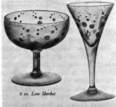
6 oz. Low Sherbet

The etchings discussed this month will be found either in the 1930-34 Catalog Reprint or in the 1949-53 Catalog Reprint.