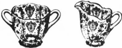
3900/41 Sugar & Cream

supplement on stemware and a finger bowl, Marlene, also known as #767, remains an obscure etching, unseen by most collectors.